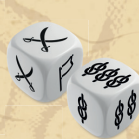
2 Special dice