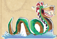
1 Sea monster with standee