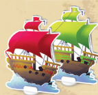
12 Ships with standees