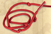
1 Rope with knots